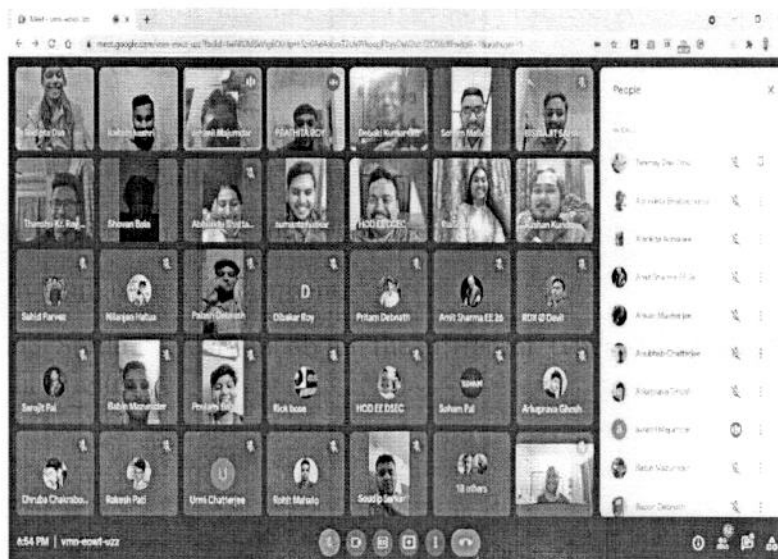
Learning in Business Communication session on 01/04/2020 and 02/04/2020