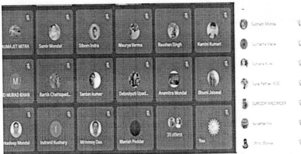
Professional Communication Skills session on 04/04/2022 and 05/04/2022