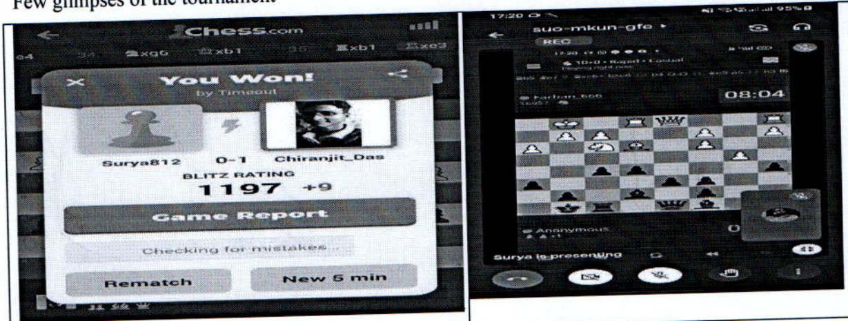
Chess Tournament held on 13.08.2020 to 14.08.2020